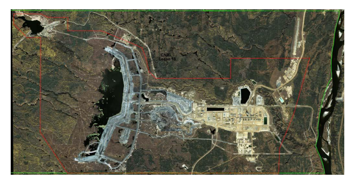
Figure 3. The compensation lake at CNRL is in the top left part of the photo. .

Oil sands sites do not consistently use compensation ponds currently, but the inspection report for CNRL describes a 77 ha Compensation Lake (Figure 3) that creates an "alternate habitat" for birds to land on. Inspectors noted many birds on the lake during a visit on 4 May 2009. We recommend that this pond, and similar ones adjacent to other oil sands operators, be regularly monitored to examine its utility as an alternate landing site during peak migration periods. Provision of compensation ponds could be an important tool for bird deterrence in future. If this function is verified, it may be important to heat compensation ponds in early spring when tailings ponds provide the only available open water. Indeed, the event of April 2008 suggests that compensation ponds would be most important in the early spring when natural water bodies are frozen and severe weather makes landings more likely (Gully 1980, Golder 2000).